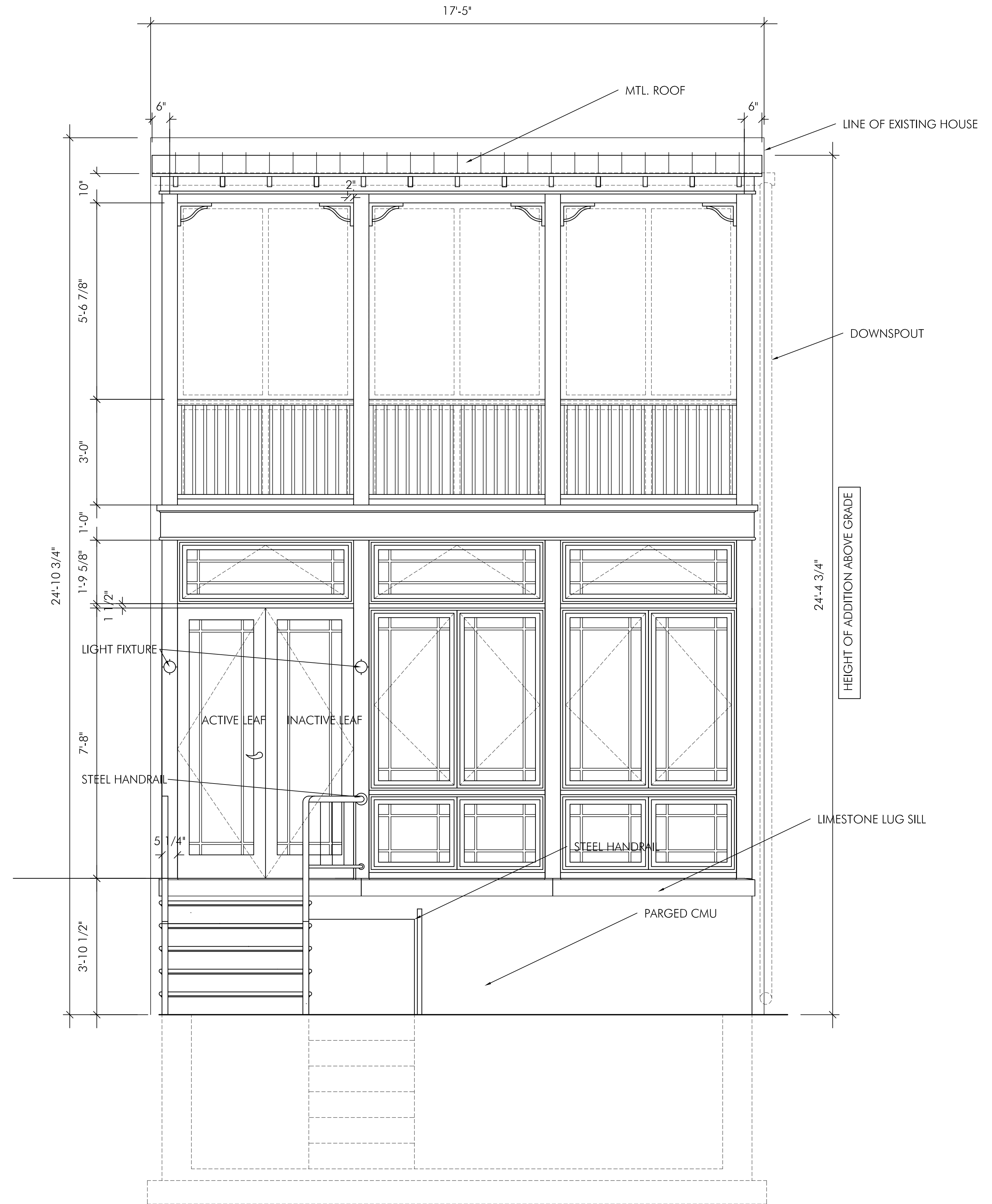
2 EAST ELEVATION A.04 Scale = 1/2" = 1'-0"